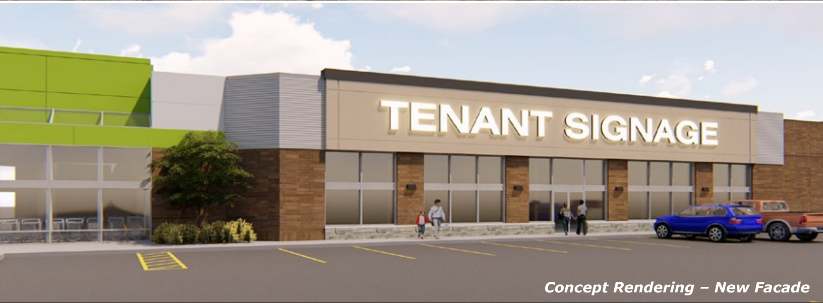
Concept Rendering – New Facade