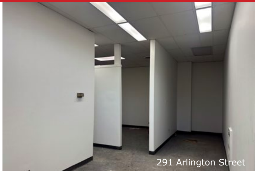
291 Arlington Street