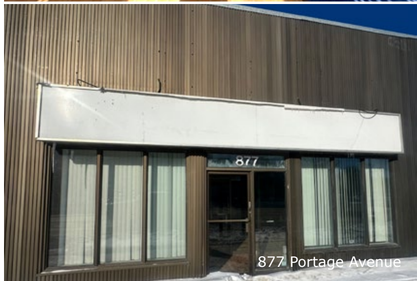
877 Portage Avenue