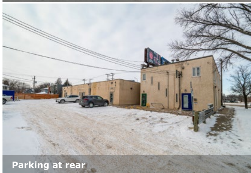
Parking at rear