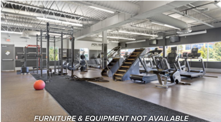
FURNITURE & EQUIPMENT NOT AVAILABLE