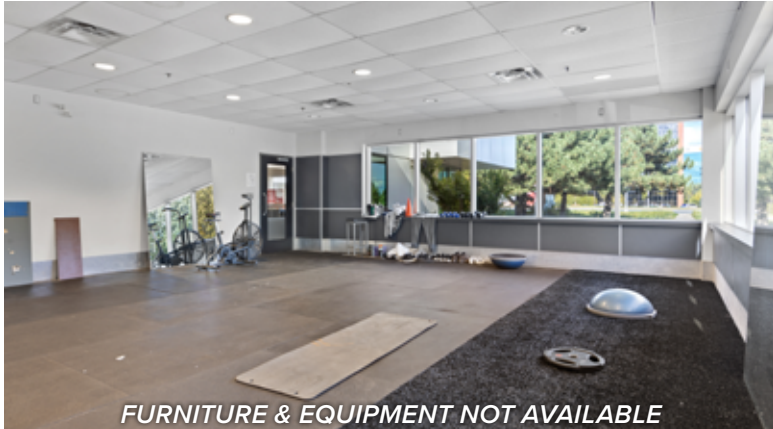
FURNITURE & EQUIPMENT NOT AVAILABLE