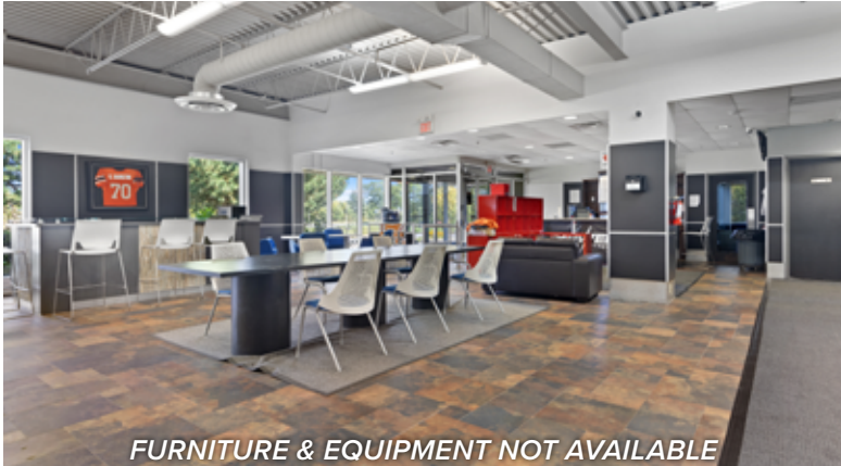
FURNITURE & EQUIPMENT NOT AVAILABLE