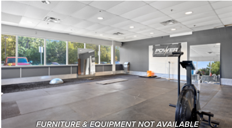
FURNITURE & EQUIPMENT NOT AVAILABLE