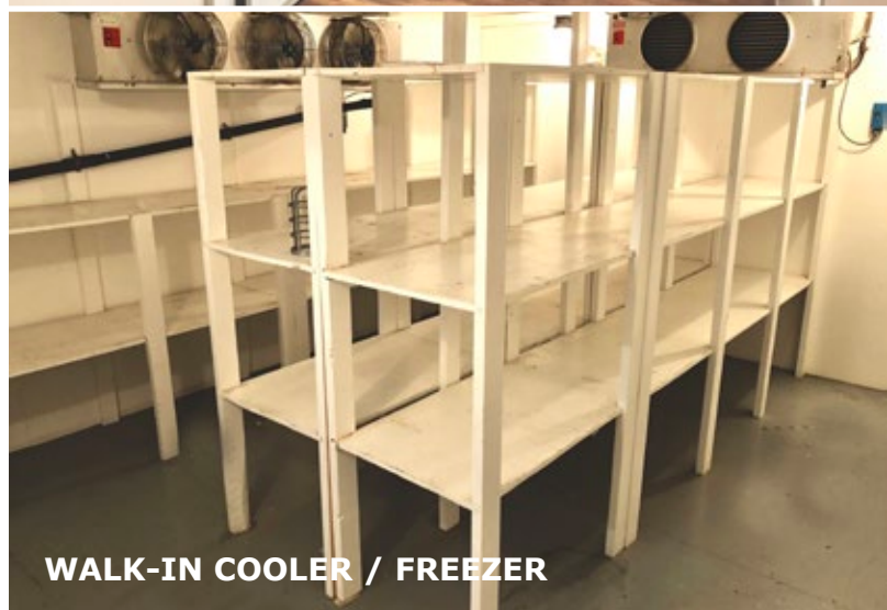
WALK-IN COOLER / FREEZER