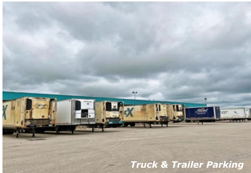
Truck & Trailer Parking